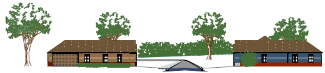
STREET ELEVATION - VIEW TO NORTH